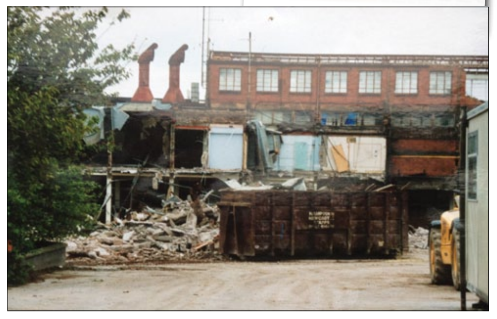
The end of an era... H&R Johnson Tiles, Highgate offices, 'under the hammer'... soon to be a pub, a petrol station and a supermarket!