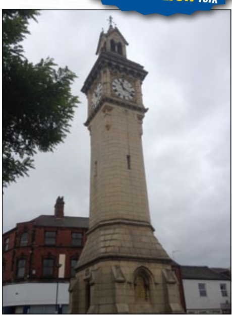
Tunstall – a town famous for its market and tile maker, H&R Johnson... But where are those tiles made now? See P3