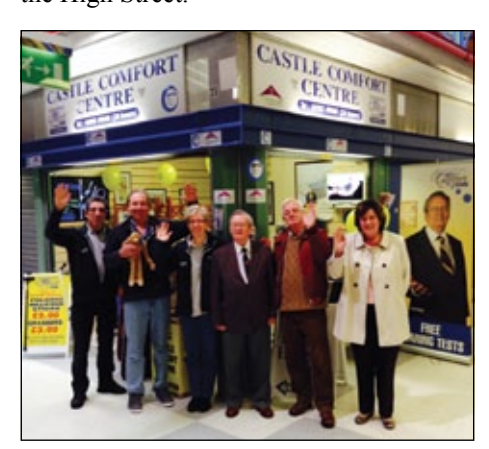
The CCC team at Tunstall Market

Yet the "QUEEN" of Tunstall has to be its legendary indoor market. Since 2001, the refurbished market with its hub of specialists, there on just Wednesdays, Fridays and Saturdays, has kept the town going through some difficult times. Markets and fairs have in fact been held in Tunstall since the 14th century at Haymarket, where Roundwell Street joins the High Street.