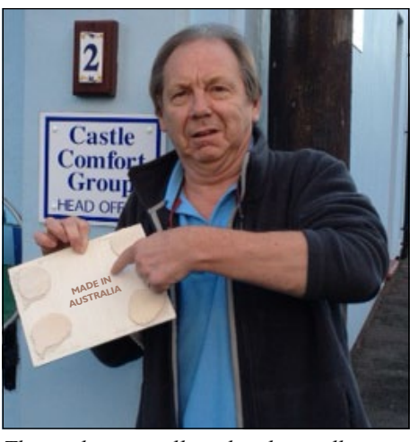
Those tiles are still made – but sadly, 'down under'!!